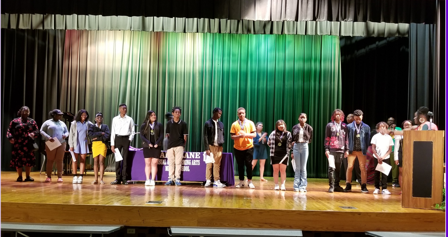
The Fine Art Department's Most Outstanding and Most Improved 8th Grade Students!