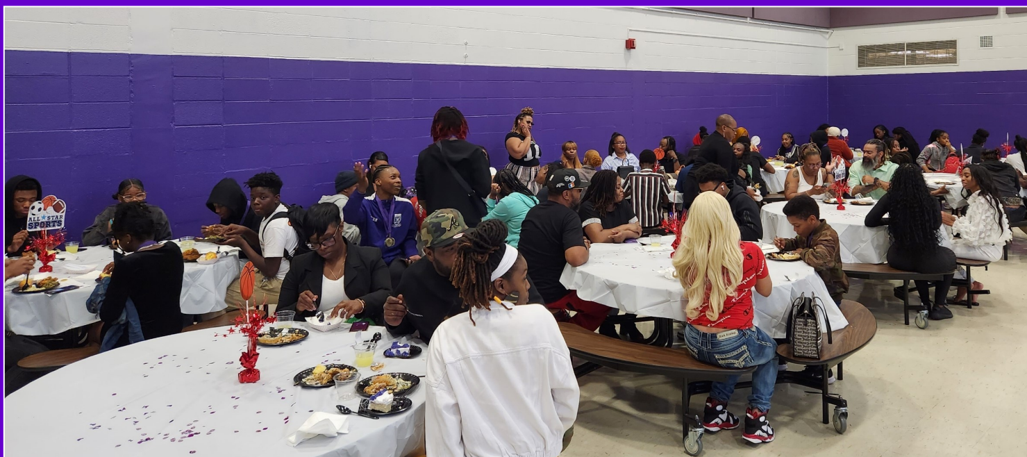
Carr Lane student athletes gather with their coaches to celebrate another great year of intramural sports!