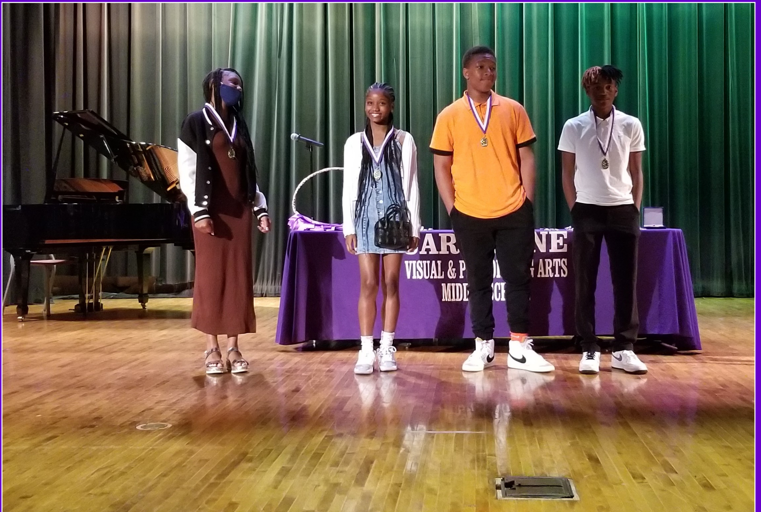
Most Outstanding and Most Improved students in Math.