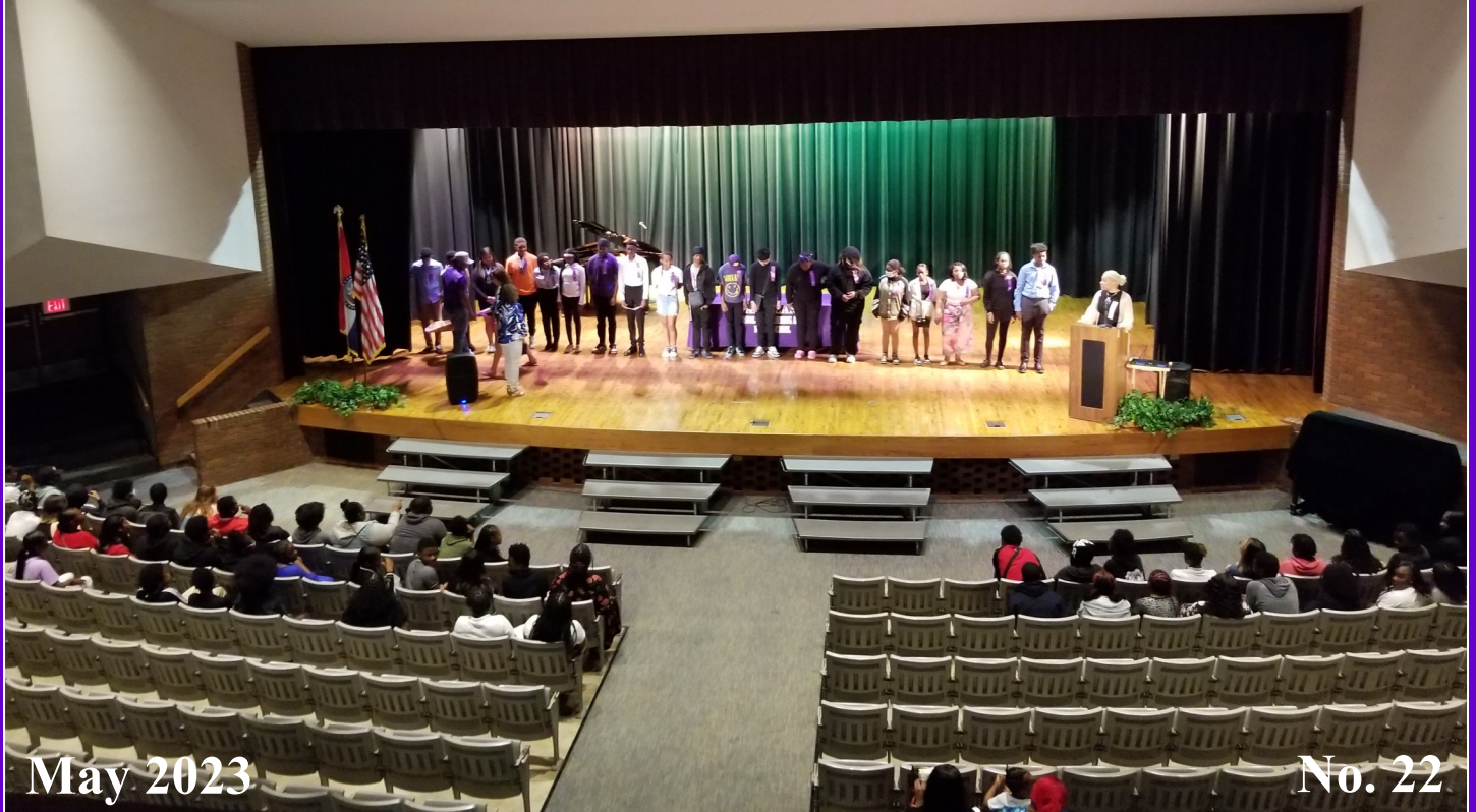
Members of the graduating class of 2027 stand on the Carr Lane VPA stage for the “Pinning Ceremony.” It was all part of the 8th Grade Awards Day Celebration held on Thursday, May 18, 2023