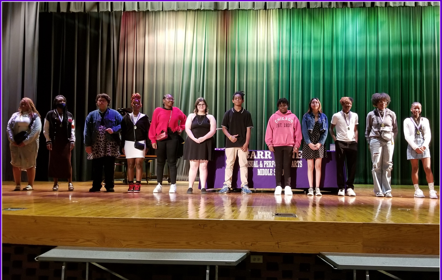
Honorable Mention for 3.0 to 3.4 GPA