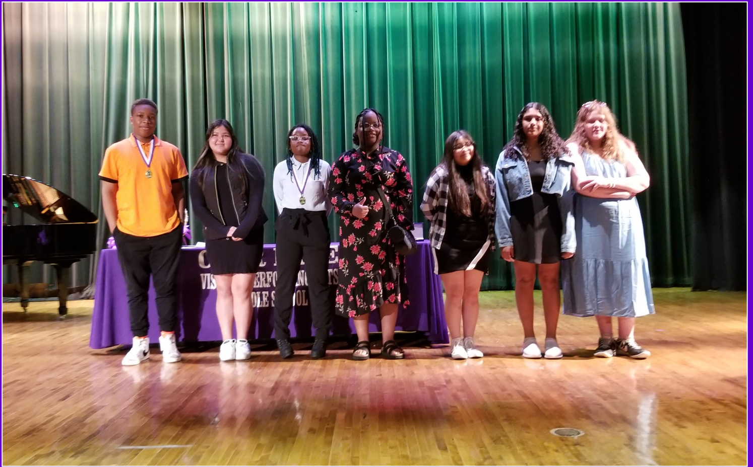
8th Grade Honors Society — 3.5 to 4.0 GPA