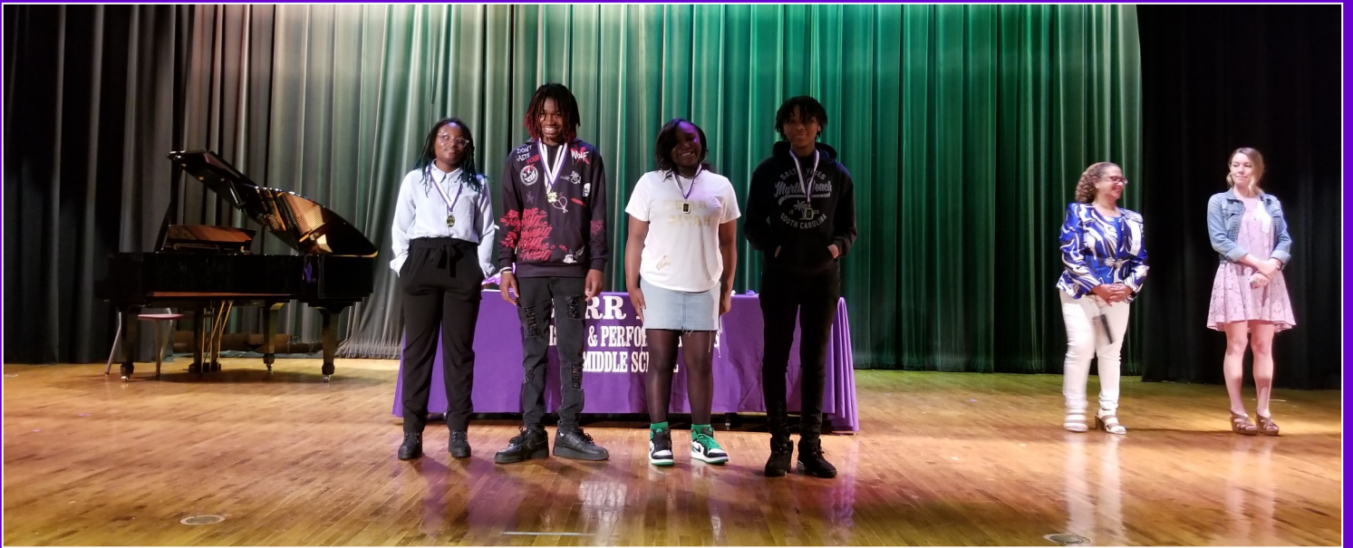
Most Outstanding and Most Improved students in ELA.