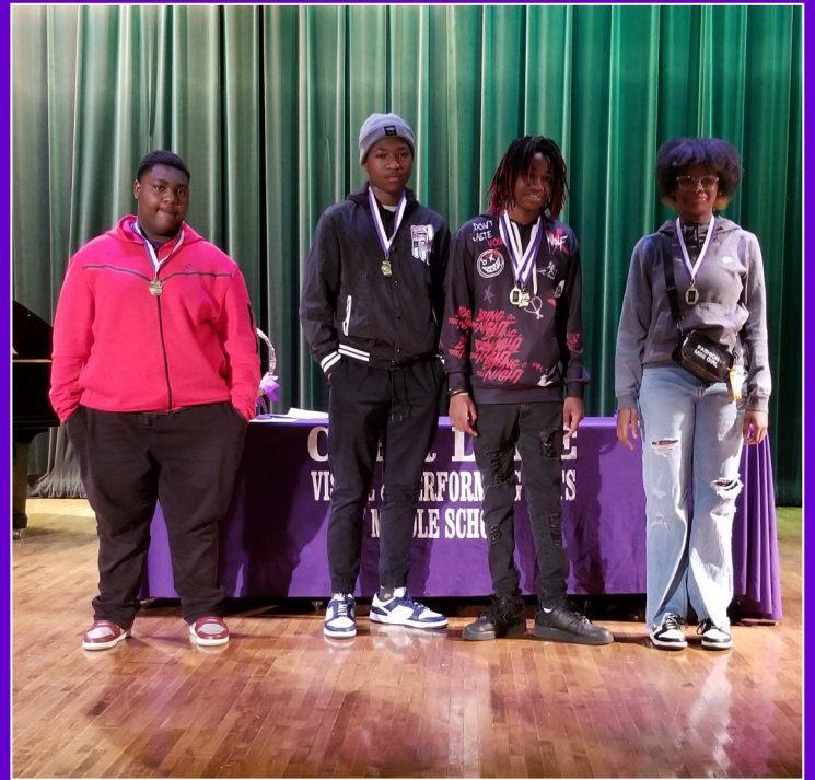
Most Outstanding and Most Improved students in Science and Social Studies.