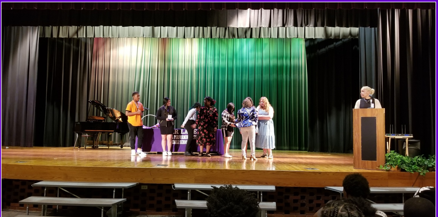
Honor Society students received their awards.